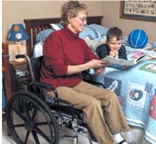
Home or Apartment