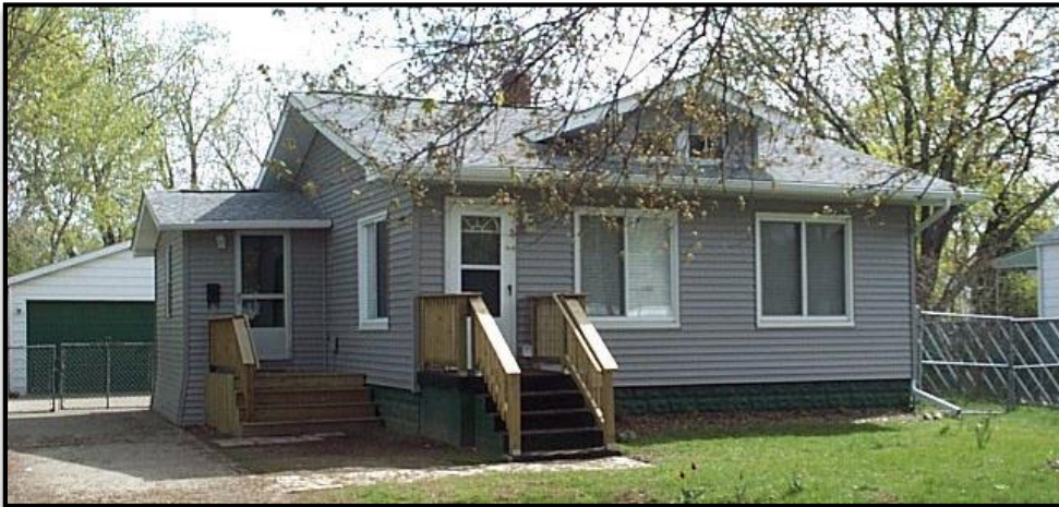
Purchase and renovate exterior